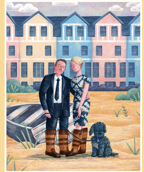
Family Scene - £500+ Full Colour Background