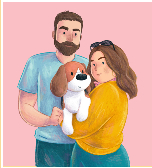
Family only - £300+ Plain / Block Colour Background

£300+ based concept or amount of people - contact for bespoke price